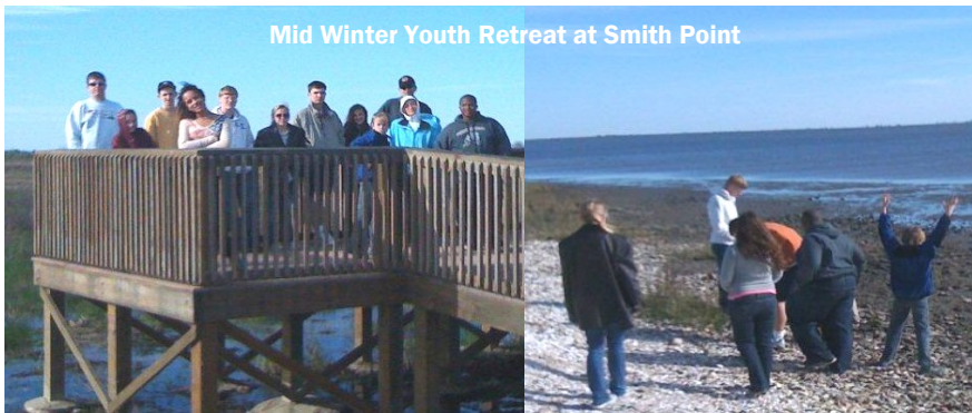
Mid Winter Youth Retreat at Smith Point